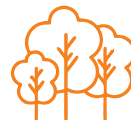
Medium environmental impact