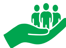
Low social impact