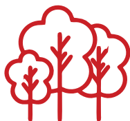
High environmental impact