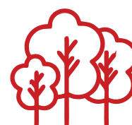
High environmental impact