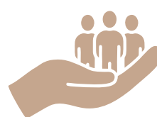
Medium social impact