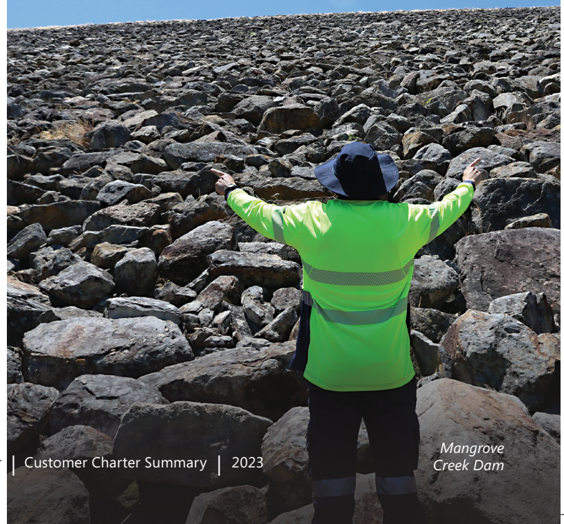
Mangrove Creek Dam