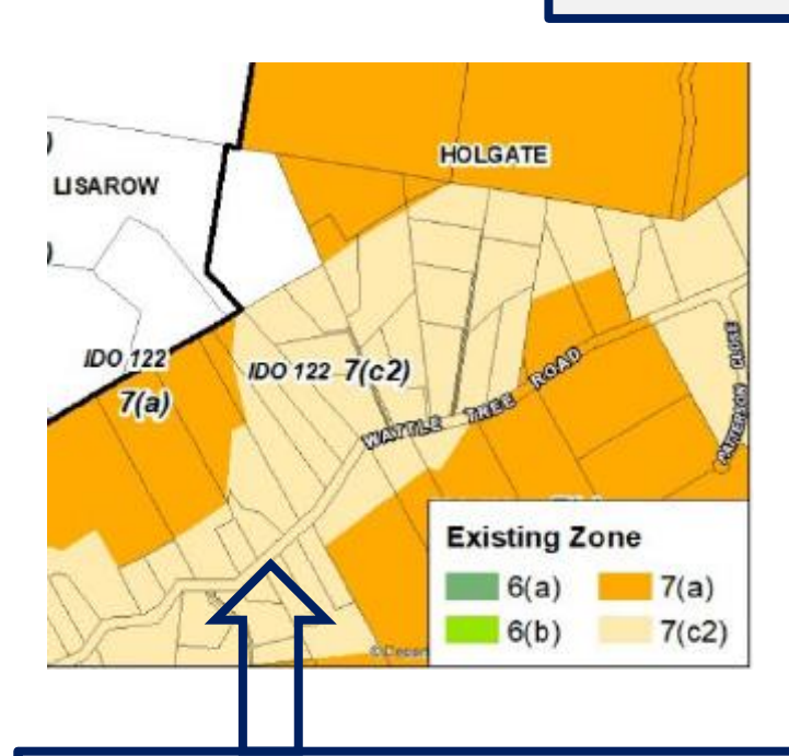
7c2 Rural Residential lots converted to C4 Environmental Living. Similar land use permissibility - retain 2Ha minimum lot size

7a Conservation lots converted to either C2 Environmental Conservation or C3 Environmental Management. Restrictive C2 Zoning applied to land of highest ecological value, C3 Zone applied to other vegetated areas along with cleared areas in and around existing dwellings. These lots retain a 40Ha minimum lot size (no increase in subdivision potential)